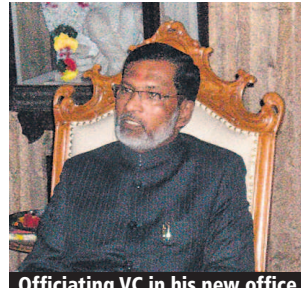
Officiating VC in his new office